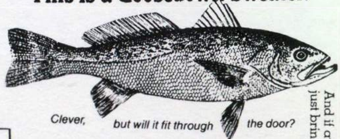
Clever, but will it fit through the door?

And if at any time you're not satisfied, just bring it back for a full refund!